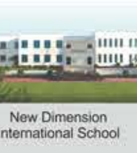
New Dimension International School